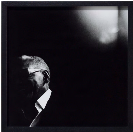
Ray Charles, Interview, 1991