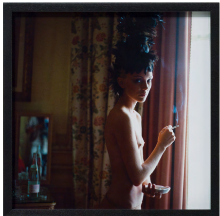
Chanel Story, Stern, 1996